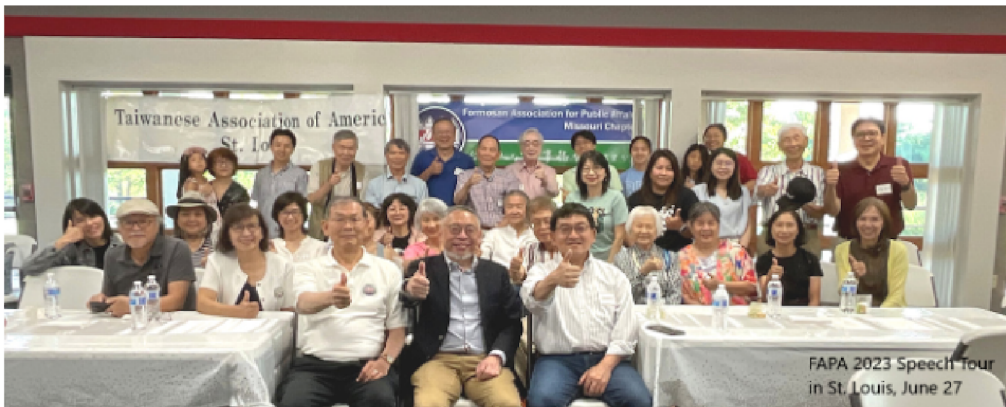
Gathering for 2023 FAPA Speech Tour