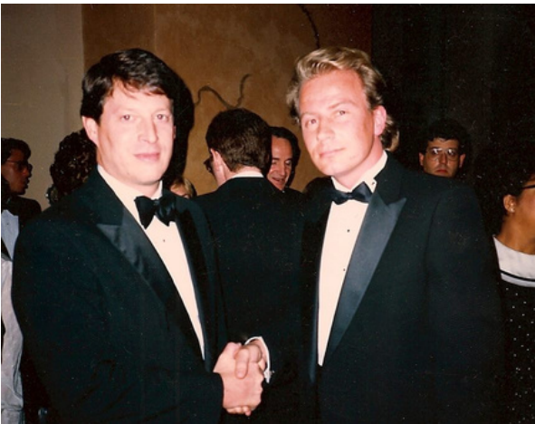
Coen with Al Gore