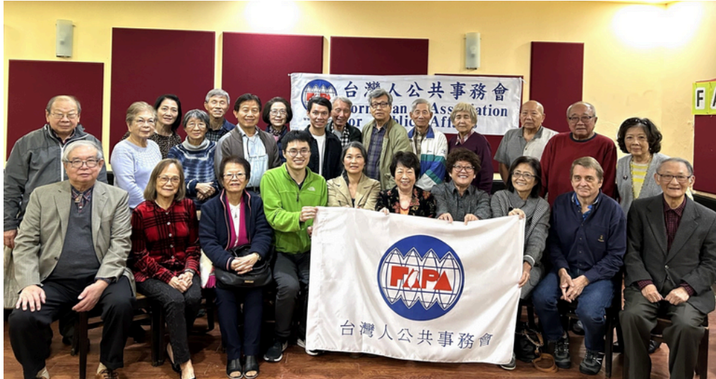
FAPA TX-C 2023/12/16 年會