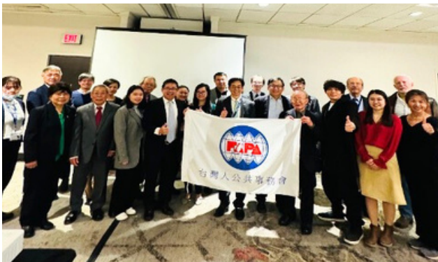
FAPA DC Chapter members participated in the 2023 Board Meeting on December 9, 2023