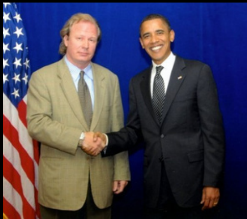
Coen and Barack Obama